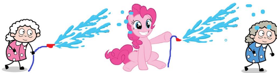
Figure 2. Example of images used to assess comprehension of object relative clauses with a 1 st -person pronoun subject.