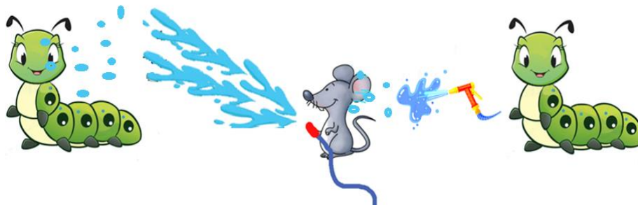
Figure 1. Example of images used to assess comprehension of object relative clauses with a 3 rd -person pronoun subject.