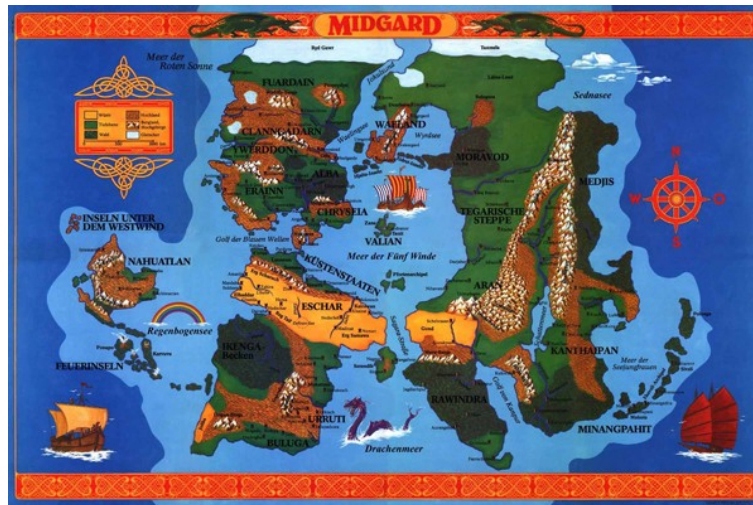
Figure 10: Map of "Midgard" 26 [44]