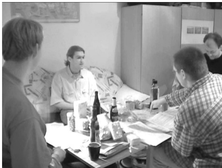
Figure 2: Group I-1 [26]