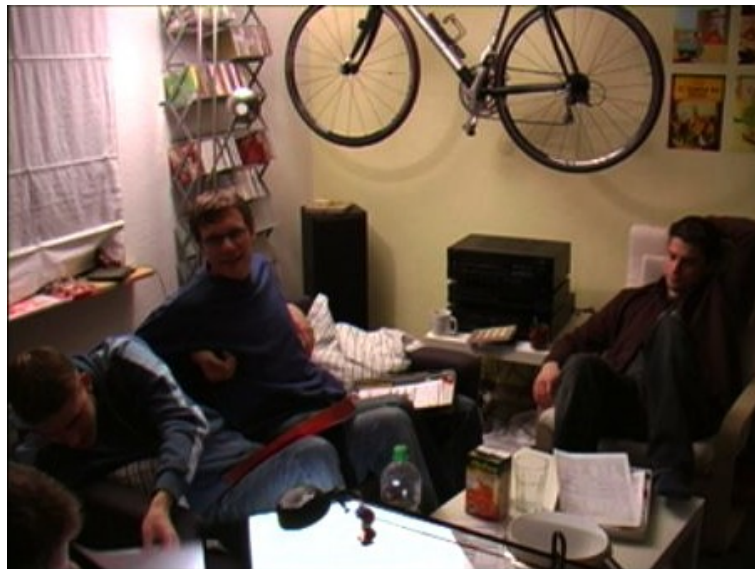
Figure 8: Group II-3 [37]