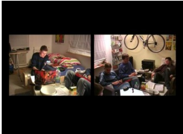
Video 2: Maps and planning actions