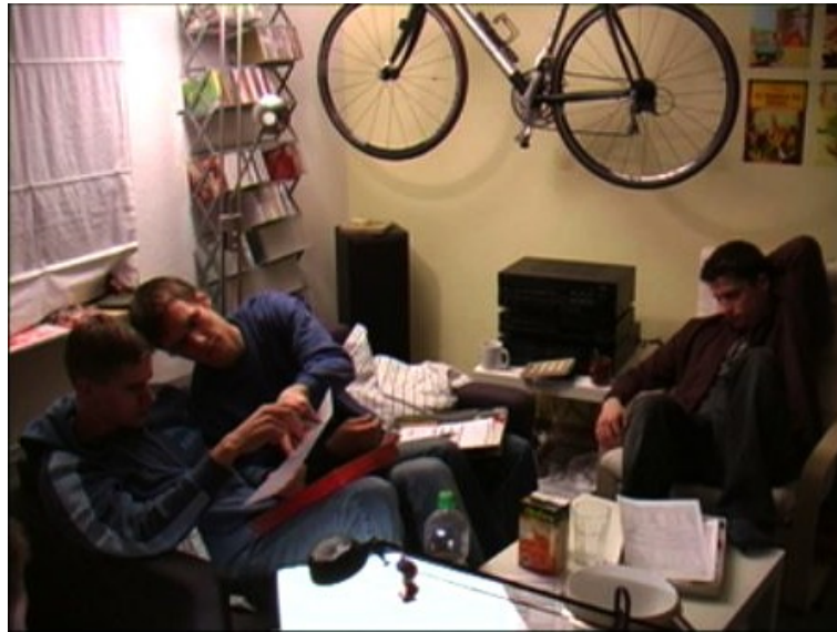
Figure 7: Group II-2 [36]