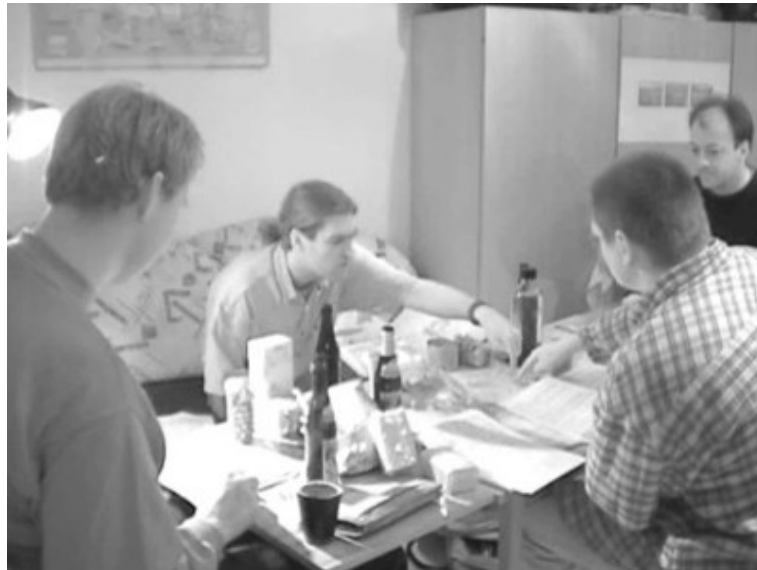
Video 1: Maps and situating oneself in the world