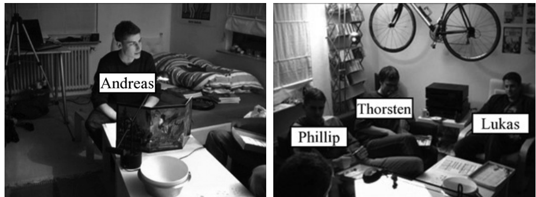
Figure 5: Overview of players in group II