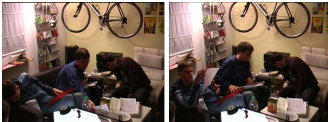
Figure 6: Group II-1 [35]