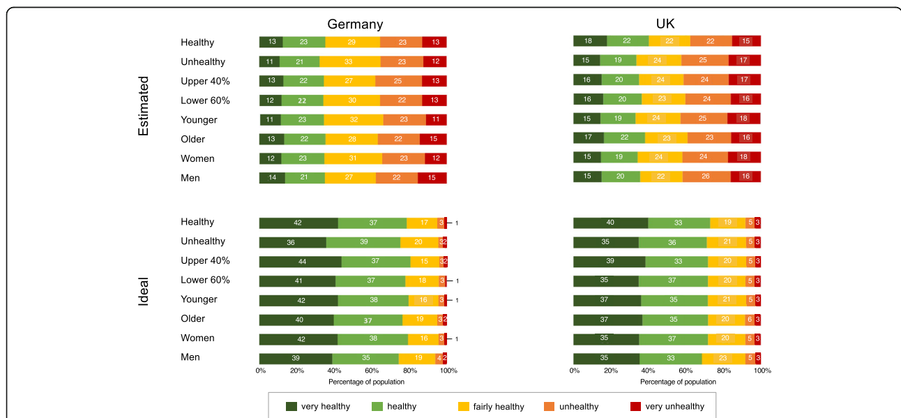
Fig. 2 Estimated and ideal national distributions of health by the five health categories for demographic groups in Germany and the United Kingdom. Note: The groups were categorized as follows: Healthy (very healthy, healthy) vs. Unhealthy (fairly health, unhealthy, very unhealthy) based on self-rated health (Germany n = 266 vs. n = 56 , UK n = 143 vs. n = 304 ); Upper 40% vs. Lower 60% based on self-rated wealth (Germany n = 53 vs. n = 236 , UK n = 192 vs. n = 249 ); Younger vs. Older based on median cut on age (Germany \leq 25 vs. > 25 ; n = 164 vs. n = 158 ; UK \leq 32 vs. > 32 ; n = 233 vs. n = 213 ); Women vs. Men (Germany n = 236 vs. n = 85 ; UK n = 315 vs. n = 130 )

In a series of additional analyses, we tested the hypothesis that there is a consensus across demographic groups