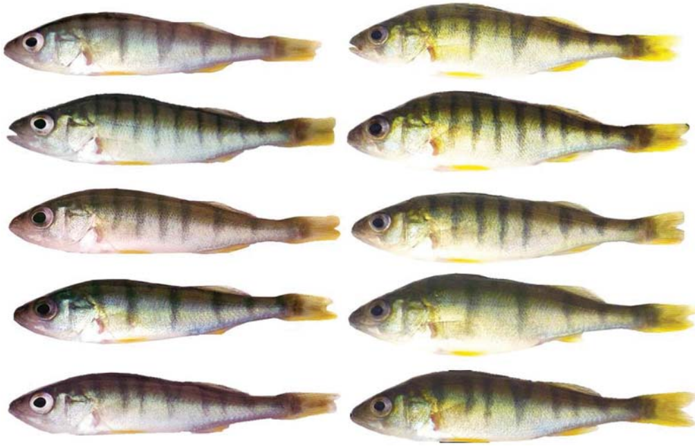
Fig. 1. Eurasian perch Perca fluviatilis photographed at the start and the end (left and right photograph, respectively) of a six weeks feeding experiment. Individuals are easily identified by their stripe pattern.

perch and two groups of Lake Constance perch of eight individuals each were stocked into aquaria of 85 L volume at 20 °C with 14 h light per day. During the experiment they were either fed with chironomid larvae (one group from each lake) or they received a dry diet (one group from each lake). Different food types were applied because the fish were used in another study which focused on the influence of food quality on fin pigmentation. Here, we restrict the method description to information relevant for the identification of stripe patterns. The fish's standard length increased from 10.8 \pm 0.6 to 12.2 \pm 0.6 (mean \pm 1 SD) for Lake Karssee perch and from 13.5 \pm 0.5 to 14.8 \pm 0.6 cm for Lake Constance perch during the six weeks of the experiment. For the mesocosm experiment 40 wild-caught fish from two littoral sites in Lake Constance were marked with a fin-cut removing approx. 1 mm 2 tissue from the distal end of the second dorsal or the anal fin, and then stocked together into an outside mesocosm with 10 m \times 1 m \times 1 m base dimensions which was supplied with lake water. The fin-cut was