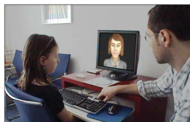
Figure 1: Participant during a DECT session.

DECT has been conceived as an interactive research tool, rather than as an intervention tool, where both experimenters and participants can work in a real-time environment. Currently, the interaction with the software has been designed in a way where the experimenter has more control over it. It is the experimenter who explains the child or adolescent what it needs to be done and even aids him in the selection of the emotional choice, as seen in Figure 1.