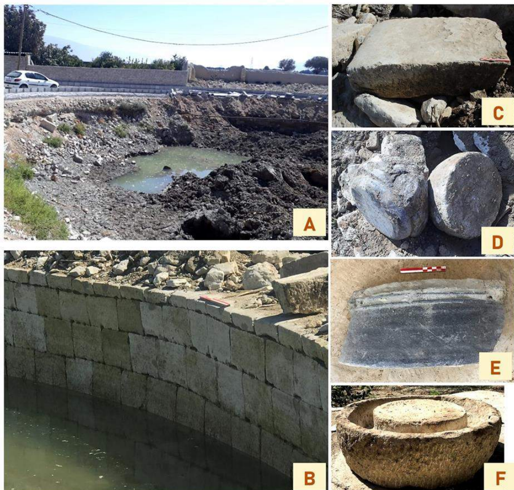
Fig. 3. The Dehbarm pond structure and mentioned finds (illustrated by E. Rashidian)

under the modern village. The outlet is regular in shape and about 2.5 m wide. Currently, less than 100 m of it is visible on the surface.