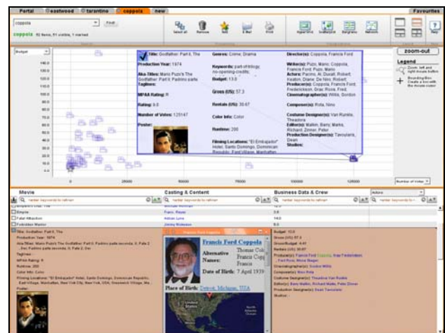
Figure 1. MedioVis: Multiple Coordinated Views with HyperScatter (top) and HyperGrid (bottom).

An information seeking process is often a combination of several searches. The user must be able to switch between different search paths without losing the afore gathered information. To support this non-linear search strategy, we integrated a tab concept, similar to multiple document interfaces.