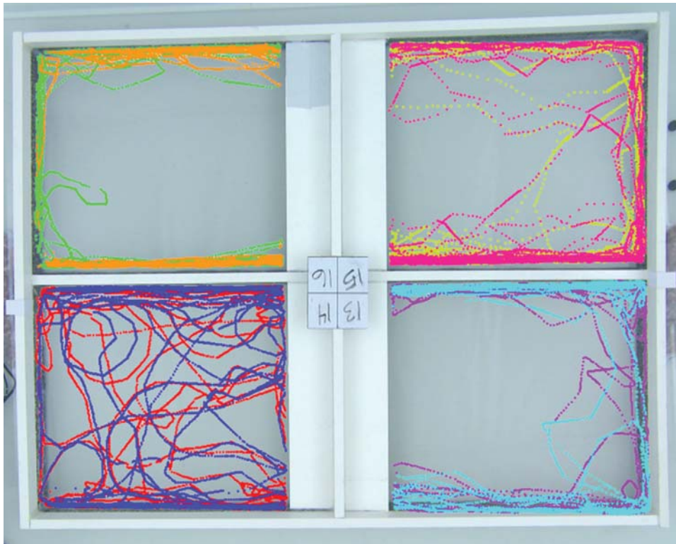
Fig. 1. Testing enclosure and sample trajectories. The photograph is a still image from a data video showing the testing arena used for both asocial and social trials, containing 4 identical enclosures, each with a shelter along one edge (white areas in the image center). Trajectories from a sample set of pair trials are overlaid on the picture. Each color represents the entire trajectory of a single fish over the course of a 10 min trial.