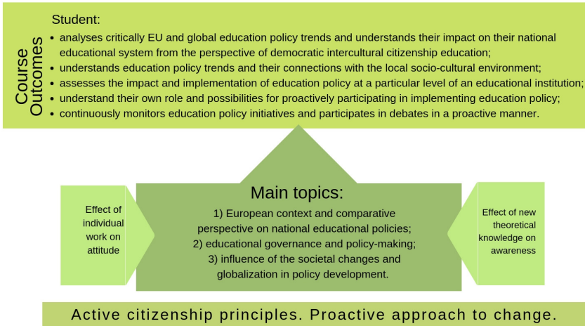
FIGURE 7.3 Concept of the module

are empowered to critically examine the main challenges related to educational governance in a contemporary, pluralistic frame, and to develop the awareness of related problems and the opportunities to mitigate these problems. The linkages between wider institutional settings of education systems and educational outcomes are emphasized and the changing role of different stakeholders (school leaders, teachers, parents) in them conceptualized.