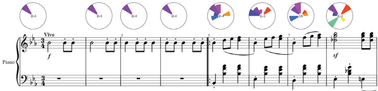
Figure 1: Augmenting piano sheet music with harmonic fingerprint glyphs facilitates the identification of recurring harmonic patterns and the comparison of musical parts to understand differences in the note distribution. Here, an excerpt from Chopin's 'Grande Valse Brillante' is augmented with the fingerprints showing a recurring pattern in the first four glyphs.