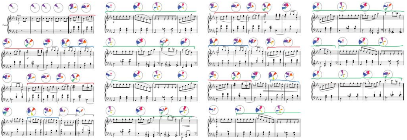
Figure 5: We told the participants to add handwritten annotations to the printed sheet music. The figure shows how E3 highlighted different patterns. E3 was provided with MS1 including the fingerprint visualization. She highlighted the first half of Theme 1 in red and its last two bars using blue color. She identified Theme 2 completely by marking it in green.

had to find the patterns without the glyphs. Due to their absence, N4 perceived it to be “ more tedious to look more closely at the single notes, ” especially if the patterns broke across multiple systems.