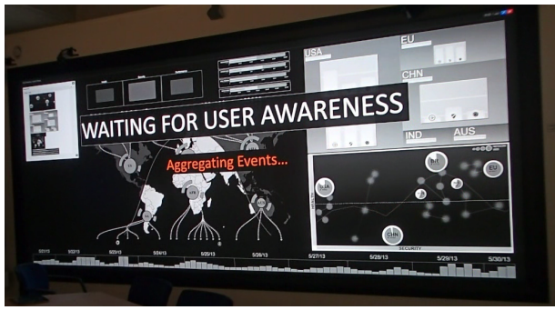
Figure 2: The display in aggregation mode.

queues can be filled by the analyst with snapshots of the current situation, and are shared between different analysts and workplaces. With this technique, the analyst using the display is able to keep up with the situation and its changes while potentially important events can be examined by other analysts. The single entries of the queue can be annotated with notes or marked as investigated. Our approach supports a human-driven decision making process, and the analyst working with the situational awareness display can incorporate findings from co-workers in his current assessment of the situation.