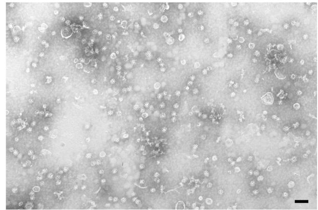
FIGURE 2 | Negative STEM micrograph of the final CCV fraction prepared from 7-day-old wild-type seedlings. Scale bar: 200 nm.