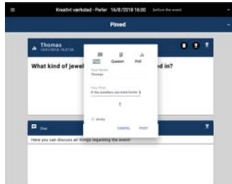
Figure 5: Example of activity sheet before activity: Creating post.