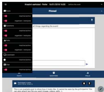
Figure 4: Configuration interface for activity organizers.

based computing [2], future library services should connect digital support for these activities as a coherent entity. Before includes support for preparing the event, enabling dissemination of the event, and the kind of sharing of material or discussions that otherwise happen externally, e.g., through social media. During the event digital support may include facilitation interaction between participants by leveraging the participants' mobile devices, e.g., through polls, media sharing, questions, or more sophisticated event specific tools, such as an audience noise meter for a poetry slam event. The event may have an afterlife where participants can continue to share thoughts or media, or where organizers can summarize the event for archival.