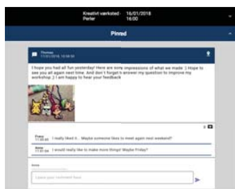
Figure 7: Example of activity sheet during activity: Participant posting images from activity.

PARTICIPATE can also use proximity sensing based on WiFi signals to establish couplings between locales and web-based applications and documents.