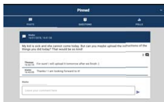
Figure 6: Example of activity sheet during activity: Participant posting to activity.