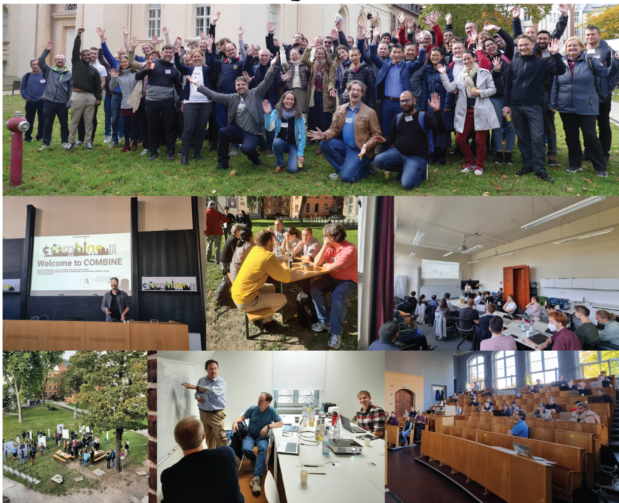
Figure 2: COMBINE meeting 2022 at the Humboldt-University Berlin.