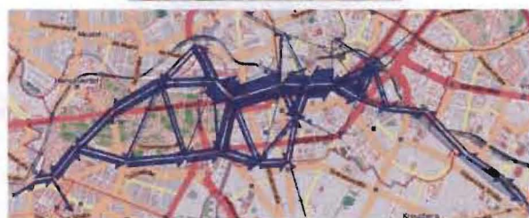
Figure 2. The flows of the photographers in Berlin at two different spatial scales.

The lower map fragment represents the movements in the central part of Berlin aggregated at a smaller spatial scale (the cluster radius was 1km). By filtering, we have removed the flows corresponding to less than 40 trajectories. We see that major movements occur along the street Unter den Linden. It is possible to see asymmetric two-directional movements. Thus, more photographers move along Unter den Linden in the direction from east to west towards Brandenburg Gate than from west to east. An opposite tendency can be seen on the southwest and south of this street, where the eastward movement Zoo – Potsdam Square – Checkpoint Charlie clearly prevails over the westward movement.