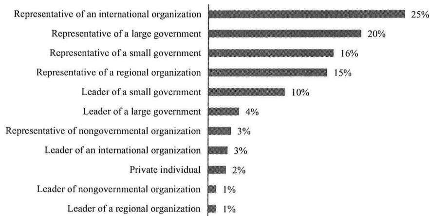
Figure 2. Mediator frequency by rank, 1946–2004