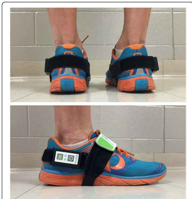
Fig. 1 Photograph showing the sensor placement on the lateral aspect of subjects' personal shoes

All statistical analyses were carried out in SPSS Version 22 (IBM Corporation, Amonk, NY). Separate 2 (device: RehaGait® vs. treadmill) × 3 (speed: normal vs. slow vs. fast) × 2 (slope: flat vs. inclined) × 2 (time: day 2 vs. day 1) fixed-factor linear mixed models were conducted for speed, stride length, cadence and stride time. Bonferroni