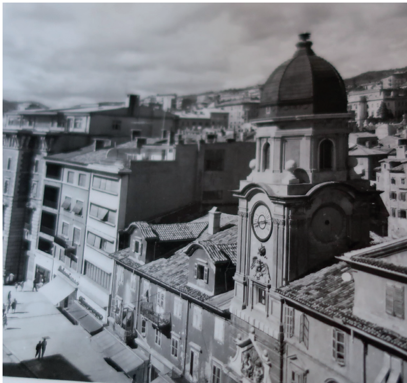
The Clock Tower without the eagle statue during the socialist Yugoslav period. 59

Also in 1949, the local council decided to remove also a much newer feature, connected more directly and explicitly to a past that was to be removed. The Temple of the Most Holy Redeemer was erected during the last years of Italian rule as a marker of the redemption of the Italian nation. It was placed on the Southern corner of the park in Mlaka, intended to mark the place where Italian land troops first entered the city on November 17th 1918. Its location marked what was seen as the liberation of the city, with the square named XVII Novembre, and the street Santa Entrata – the Holy Entrance. The temple replaced a small old church of St Andrew, removed through the Regulatory Plan of 1938, which made place for this symbolic new structure. The vision was to shape new civic center for Fiume, bringing together the profane and the sacred in a new, representative public space and expression of Italianness in Fiume. 60 The temple was built with the help of money