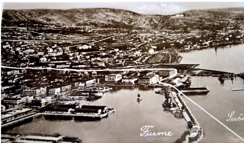
The border between Italy (Fiume) and Yugoslavia (Sušak), 1937. 26

venes gave Fiume to the first and Sušak to the latter, with the river that gave its name to the city becoming the state border.