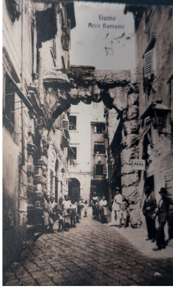
Street scene from the old town under the Roman gate. 49

An underlying assumption could be that with residents already gone, technical language could hide attempts to erasure. Then the question would be why were those very sections of the old town cleared, and not others- and why would some particular ensembles, described in contemporary accounts as slum-like, suggest more Italianness than others. Moreover, Belvedere, the nineteenth - earliest 20th century neighbourhood with an architecture resembling that in Northern Italian towns, was the main area associated with Italians. 50 As such, we cannot infer from the examined sources that the old town redevelopment can be connected to an intentionality of frontier urbanism practices related to nation-building. What the case of the old town reflects instead is how practices associated with urban redevelopment were framed as technical operations in the spirit of the times. Residents and owners, both those who left and those who stayed, did not have a say in the evolution of the area, but aimed at negotiating forms of compensation for the loss of the built environment.