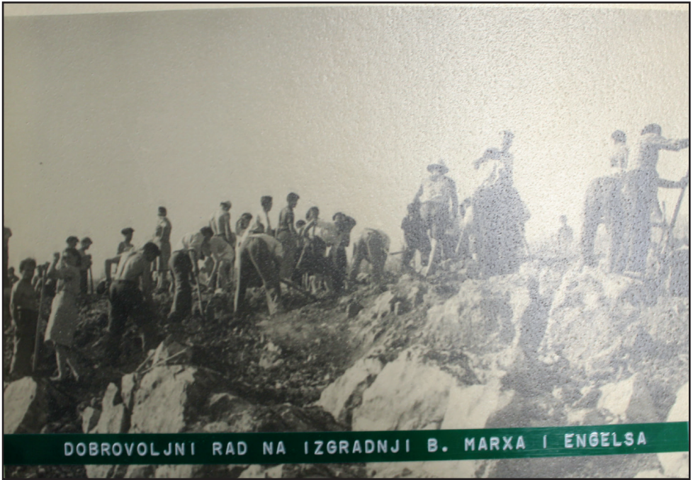
Volunteers building the National Front Highway (later Marx and Engels highway). 69

At the completion of the project, the press declared the success of the highway construction as the proof of the importance and popularity of the socialist idea. A first page title boasted that the work of the highway was a response to the “calumnious campaign of detractors”, the enemies of socialism. 70 The road thus became an iconic project for the new state, and the erasure of the Votive Temple at its Eastern end reflected how the elements of the old fascist rule were replaced by socialism as a world of the future. Just as the redevelopment of the old town echoed the transnational practice of post-war ruin clearing in the name of Sanierung , the highway represented the transnational socialist project, fixating the state presence in its frontier to the capitalist world.