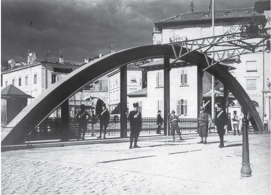
Border crossing at the bridge over the Eneo/Rječina river.

the increase in the number of people declaring themselves Italian, including also new arrivals from other parts of Italy, as well as people from mixed or Croatian-speaking family backgrounds who took on the Italian identity in a period where Slavic culture was being marginalized. In 1936, 72% of people in Fiume declared themselves Italians.