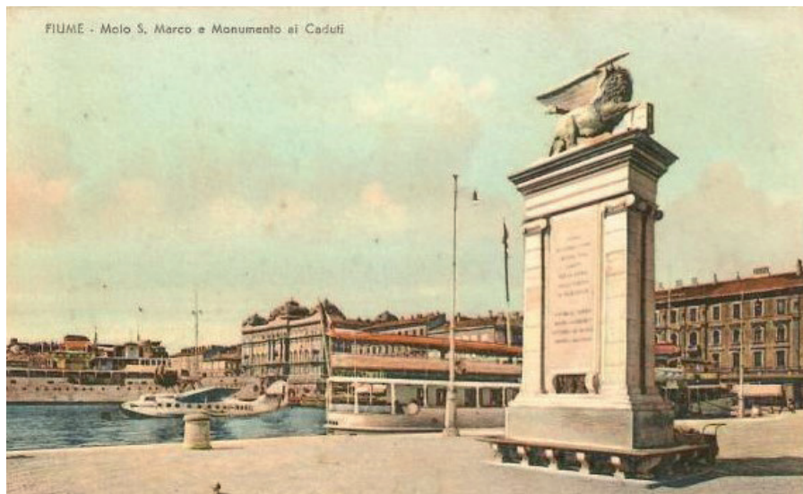
The Venetian Lion. 51