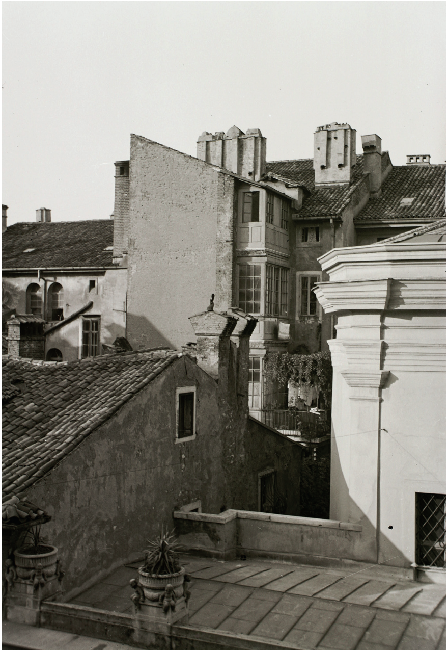
Fiume (Rijeka).