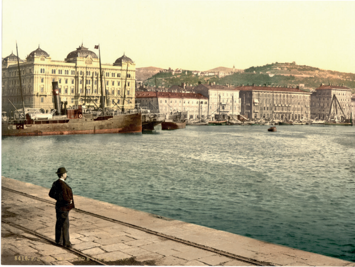
Fiume/Rijeka's waterfront, with the Adria palace, seat of the first Hungarian shipping company founded in 1882, in the left hand side. 21

Fiume's architectural change can be seen as a form of a frontier urbanism in the sense of fixating the outpost of the state, the window to the world, the frontier in the sense of the open horizon of growth, rather than the contested space to be secured. The allegiance of the local elites to the Hungarian crown was increasingly connected to the recognition of local autonomy, as opposed to platforms to incorporate the city into a wider Italy and, particularly, Croatia of which the city was treated distinctively, with a status of a corpus separatum of Hungary beyond Zagreb's rule. A famous quote of mayor Maylender in 1897 indicated "Fiume's Hungarian patriotism cannot be imagined without its autonomy". 22 However, the city was also emblematic for both Southern Slavic and Italian narratives of the modern nation. On the one side, the Rijeka Resolution of 1905 created a Serb-Croat coalition within Austria-Hungarian politics. On the other, the wide circulation of poet Gabriele D'Annunzio's 1919 Pentecoste d'Italia essay and tumultuous events after the First World War in Fiume projected the "redeemed city" as an important element in the imaginary of Italianness.