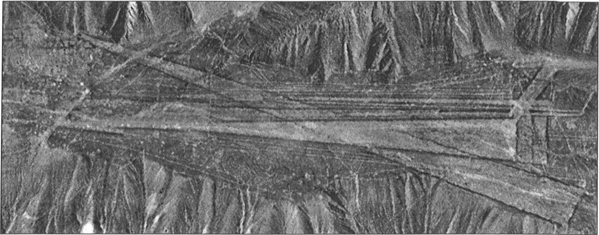
Fig. 1. Orthophoto (resolution: 25 cm) of geoglyphs on site PAP 51A north of Palpa. The complex is composed of lines, spirals and trapezoids constructed over several centuries.