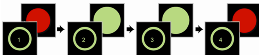
FIGURE 1 | Sequence learning task. The task was self-paced and there were no stimuli to look at; only the color-coded feedback signal to the button presses appeared on the screen. The lower row in the figure represents the four button presses that children would carry out on the

computer keyboard. The upper row shows the feedback signal, with red indicating negative feedback (wrong button) and green indicating positive feedback (correct button) after each button press. Figure adapted from Seo et al. (2010).