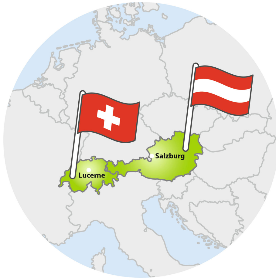
Fig. 1 The radiologists from two breast imaging centers at the University Hospital Salzburg (Austria) and St. Anna Hospital in Lucerne (Switzerland) participated in this study