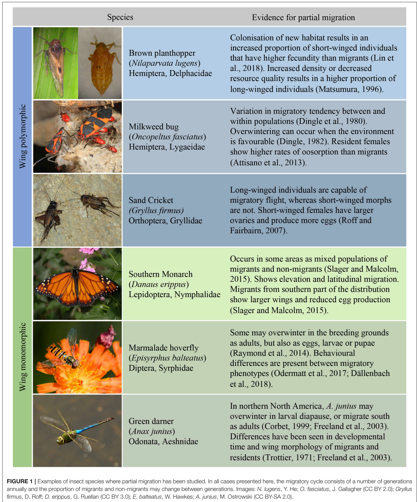
FIGURE 1 | Examples of insect species where partial migration has been studied. In all cases presented here, the migratory cycle consists of a number of generations annually and the proportion of migrants and non-migrants may change between generations. Images: N. lugens , Y. He; O. fasciatus , J. Gallagher (CC BY 2.0); Gryllus firmus , D. Roff; D. erippus , G. Ruellan (CC BY 3.0); E. balteatus , W. Hawkes; A. junius , M. Ostrowski (CC BY-SA 2.0).