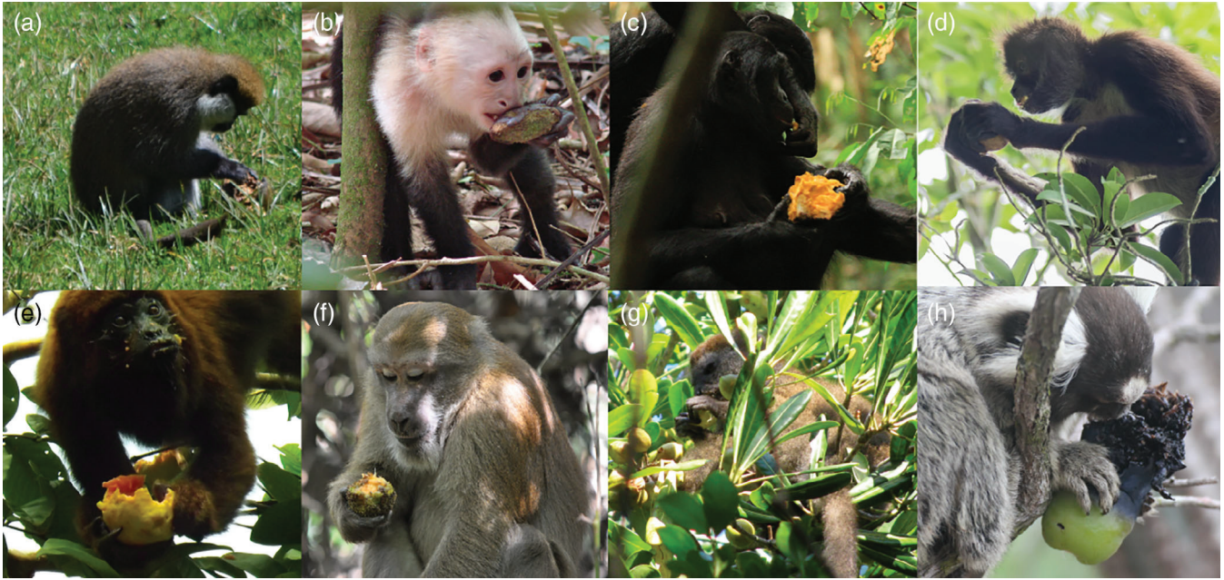
FIGURE 1 Wild primates consuming fermented fruits. (a) Chlorocebus djamdjamensis consuming L. abyssinica at Kokosa, Ethiopia; (b) Cebus capucinus imitator consuming D. oleifera at La Suerte Biological Field Station, Costa Rica; (c) Pan paniscus consuming A. mannii at LuiKatole, Democratic Republic of Congo; (d) Ateles geoffroyi consuming M. zapota at Punta Laguna, Mexico; (e) Alouatta guariba clamitans consuming P. guajava at Parque São Paulo, Brazil; (f) Macaca assamensis consuming N. cadamba at Phu Khieo Wildlife Sanctuary, Thailand; (g) Hapalemur meridionalis consuming Uapaca sp. at Mandena, Madagascar; (h) Callithrix jacchus consuming P. pachycladus at Baracuh Biological Field Station, Brazil

all fruits (95%) were consumed both ripe/unfermented and overripe/fermented (Table 3). In some cases, late-stage fermented fruits were only consumed when the patch was depleted of ripe fruits (Table S1). We also reported cases in which very ripe or late-stage fermented fruits appeared to be preferred over semi-ripe and unripe fruits. Specifically, Cebus imitator at La Suerte, Costa Rica, was observed frequently knocking ripe Dipteryx oleifera (Fabaceae) fruits to the ground and returning up to 2 weeks later to consume them (up to 15% of feeding time seasonally, EKM personal observation). These fruits were never consumed unfermented by the capuchins. Eulemur fulvus at Ampijiroa, Madagascar (up to 5% of feeding time seasonally, PTR personal observation) and Ateles geoffroyi at Punta Laguna, Mexico (up to 1% of feeding time seasonally, BPG personal observation) were also reported to drop fruits to the ground and return to feed on them later. However, unlike the capuchins, both lemurs and spider monkeys consumed the target fruits in different stages of ripening, although the lemurs appeared to prefer fallen fruits over those on the trees since they would consume fallen fruits first when both were available.