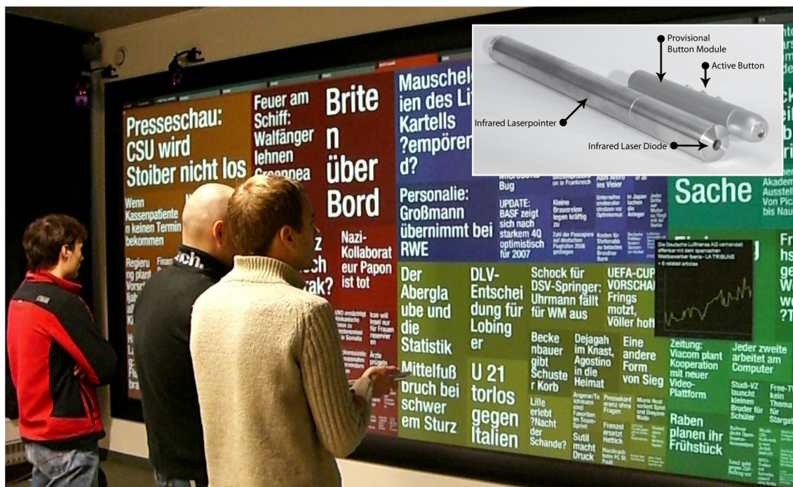
Figure 1: Newsmap visualization on the Powerwall in Konstanz and the infrared Laserpointer being evaluated

Mobility is a fundamental requirement for input devices that are to be used with LHRDs, and it is satisfied per se by Laserpointer-Tracking, since it is the reflection of the laser on the display that is tracked and not the position of the laser device itself. Hence, from any position and at any distance, the user can always interact in the same way. Whether the user writes directly on the display or is pointing to an object from afar, there is no need to change the input device or the interaction technique.