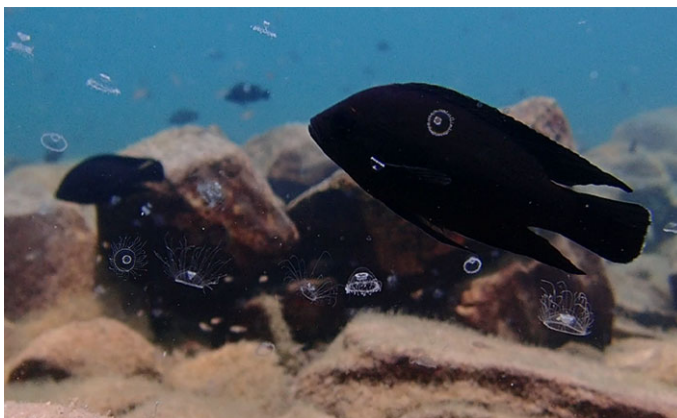
Figure 1. Field photograph of adult Variabilichromis moorii and fry on their territory amidst Limnocnida tanganjicae jellyfish.

by internal seiching that leads to water mixing and upward nutrient fluxes [18,22]. A previous bloom was documented to have reached approximately 3000 \text{ individuals m}^{-3} by the coastline near Mpulungu, Zambia [18]. To avoid harmful UV radiation in the upper layers during day times with peak radiation, L. tanganjicae undergo low amplitude diel vertical migrations [18]. Exposure of L. tanganjicae to UV radiation at surface waters (top 5 m) during midday leads to mortality within 1 h [18].