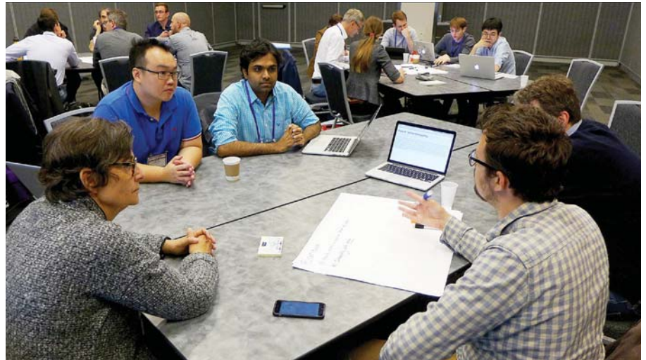
Discussing opportunities and challenges for cross-device interaction at the CHI 2016 workshop.

Designing for scale and interoperability. Because devices and their operating systems are still largely designed from the perspective of a single user interacting with a single device, interconnecting different or large numbers of devices tends to be complicated. Without certain pre-programmed behavior or a priori knowledge about all possible configurations, cross-device configurations of systems are simply not possible. This makes ad hoc federations of devices that have never before been connected very difficult. Moreover, users often want to combine devices for specific tasks and activities. Most current approaches expose users to infrastructure problems where they need to connect, pair, or install additional software to make devices work together. Sharing content across devices and people is simply not an