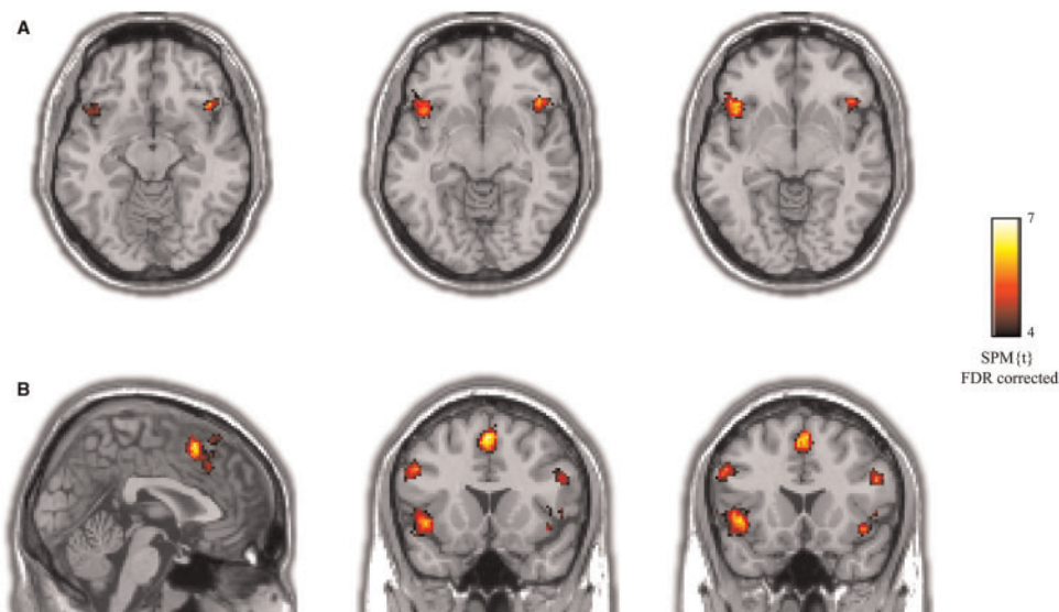
Fig. 1 (A) Activations of aINS toward risky persons in the explicit condition. (B) Illustration of MFC and dlPFC, which in addition to the insula showed an increased activation toward risky persons.

(implicit vs explicit) and Risk (low vs high). All ROIs showed a significant increase in activation, F_s(1, 21) > 22.5 , p < 0.0001 . Of interest, a significant interaction of Condition \times Risk was observed in left and right insular cortex, F_s(1, 21) > 7.9 , p < 0.01 , left and right dlPFC, F_s(1, 21) > 8.6 , p < 0.01 , and MFC F(1, 21) = 10.7 , p < 0.01 , indicating an increased differentiation of high- and low-risk stimuli in the explicit condition (see Figure 2).