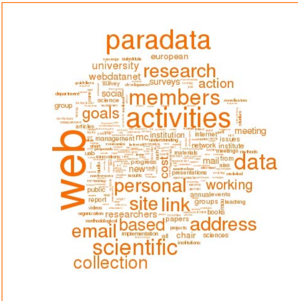
The word cloud is based on content from the network's website at http://webdatanet.eu/

Acknowledgement: The authors would like to acknowledge networking support by the COST Action IS1004.