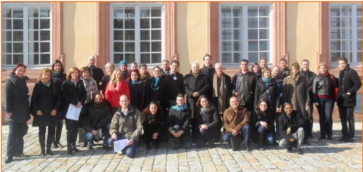
WEBDATANET members who attended a meeting in Mannheim in 2012.

In order to provide web-based data collection with the scientific validity that traditional research methods already enjoy and to tackle remaining methodological challenges WEBDATANET was established in June 2011 as a COST Action and will continue working on these issues through the COST Action until June 2015. It is anticipated that beyond 2015, the interactions of this scientific community will continue in the context of integrated projects and other strategic research initiatives.